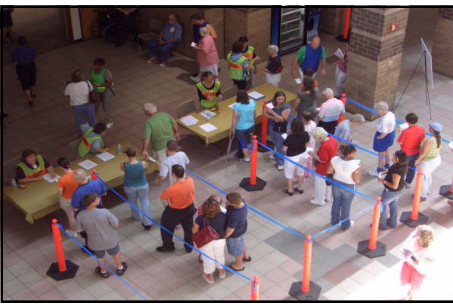
Mass Dispensing Drill at River Center

The Scott County Health Department's (SCHD) Public Health Preparedness program is responsible for all the planning activities that allow for a safe and prepared community. Operating through a grant from the Iowa Department of Public Health, Public Health Preparedness' role is to develop plans and ideas to help protect the community against threats such as pandemic influenza, biological or chemical agent, and natural disasters. Public Health Preparedness staff actively work with other community agencies to work towards good communication and the sharing of resources.