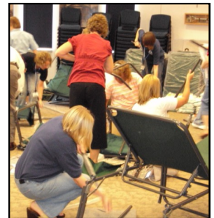
SCHD Staff Practicing Setting Up an Emergency Shelter

The Health Department also holds its own internal drills, annually, to exercise staff's roles during a public health emergency. The SCHD takes public health preparedness very seriously, and we want our community to know that we already have plans in place, and that we only have the public's safety in mind when planning and exercising for future public health emergencies.